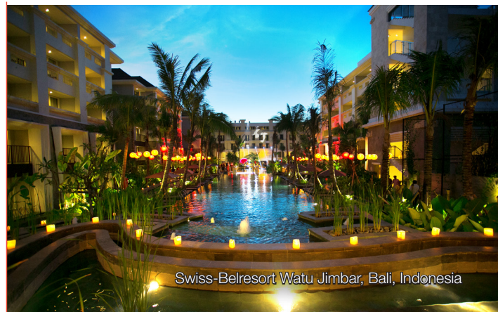
Swiss-Belresort Watu Jimbar, Bali, Indonesia

The Group’s unique fusion of Swiss hospitality professionalism and Asian passion and service is what truly sets Swiss-Belhotel International apart from other hotel management companies. Each of the Group’s properties proudly carries the hallmark of Swiss-Belhotel International, a unique combination of quality, convenient location and dedication to providing excellent value to both business and leisure travellers. This commitment is enshrined in Swiss-Belhotel International’s philosophy of “Passion and Professionalism”. The most treasured reward for Swiss-Belhotel International is that guests return, as the ultimate compliment to the staff, the management and to the Group as a whole.