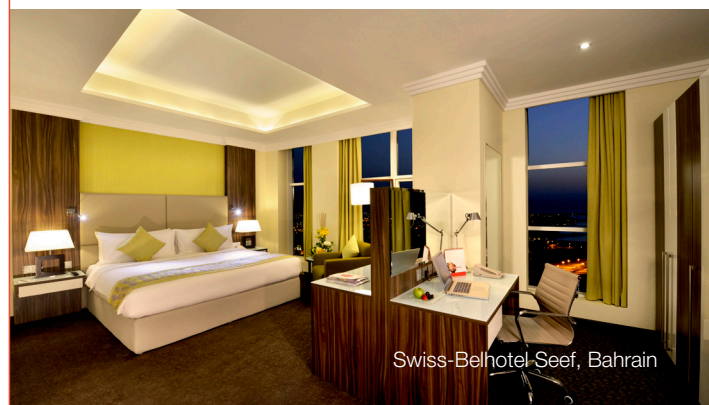
Swiss-Belhotel Seef, Bahrain